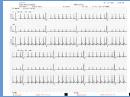
1 or 3 channel rhythm recording